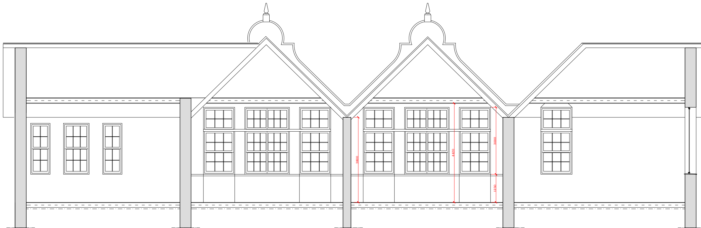
EXISTING SECTION B-B